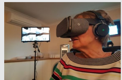
A whole new experience of the AGM!