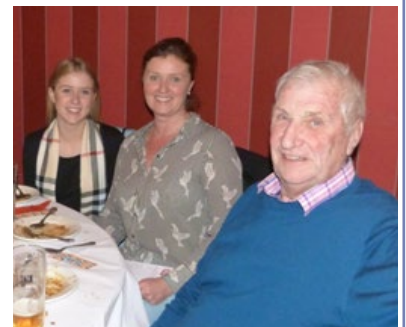
Thank you to everyone who came to Zen city and helped us to raise our highest total for a charity meal!